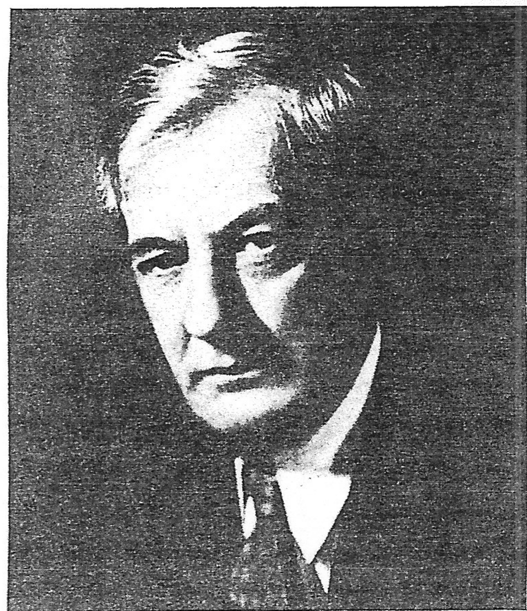
Sherwood Anderson — Author — Member of National Academy of Arts and Letters 1876-1941